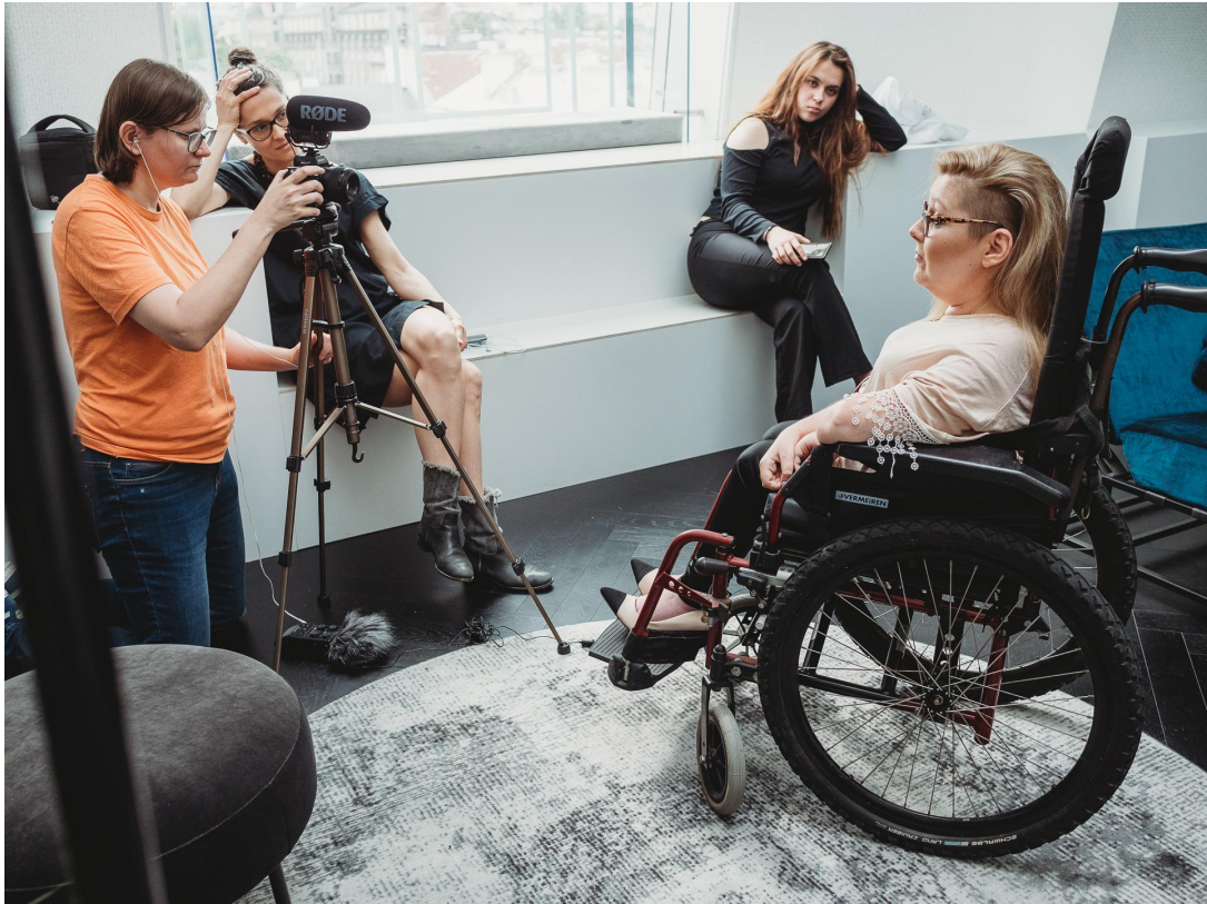
Photographic project with 12 women with SMA “Shades of beauty” - SMA Foundation calendar

https://youtu.be/Pa1-kFRS3VE?si=HSj3CCSeFg9ld42l