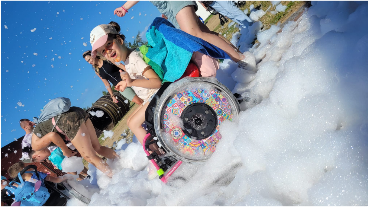
annual family camp

https://youtu.be/0MUEhp2C6yw?si=RqNovUohotjXFR4C