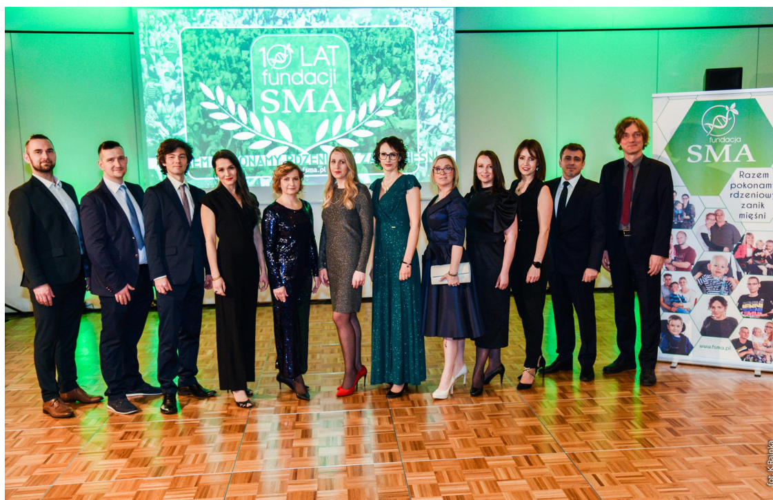
10th anniversary of the Foundation - part of our voluntary team