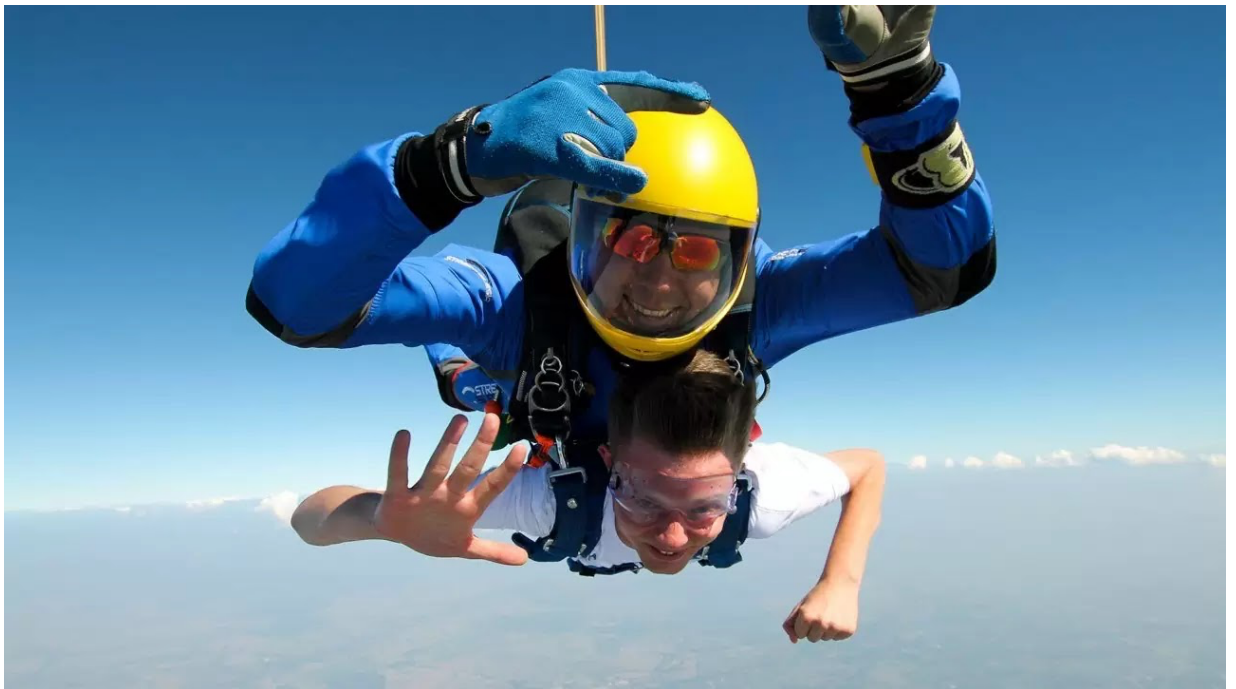
parachuting events - people with SMA and their families were jumping to promote knowledge about disease and fight for reimbursement of treatment in Poland

https://youtu.be/0MUEhp2C6yw?si=RqNovUohotjXFR4C