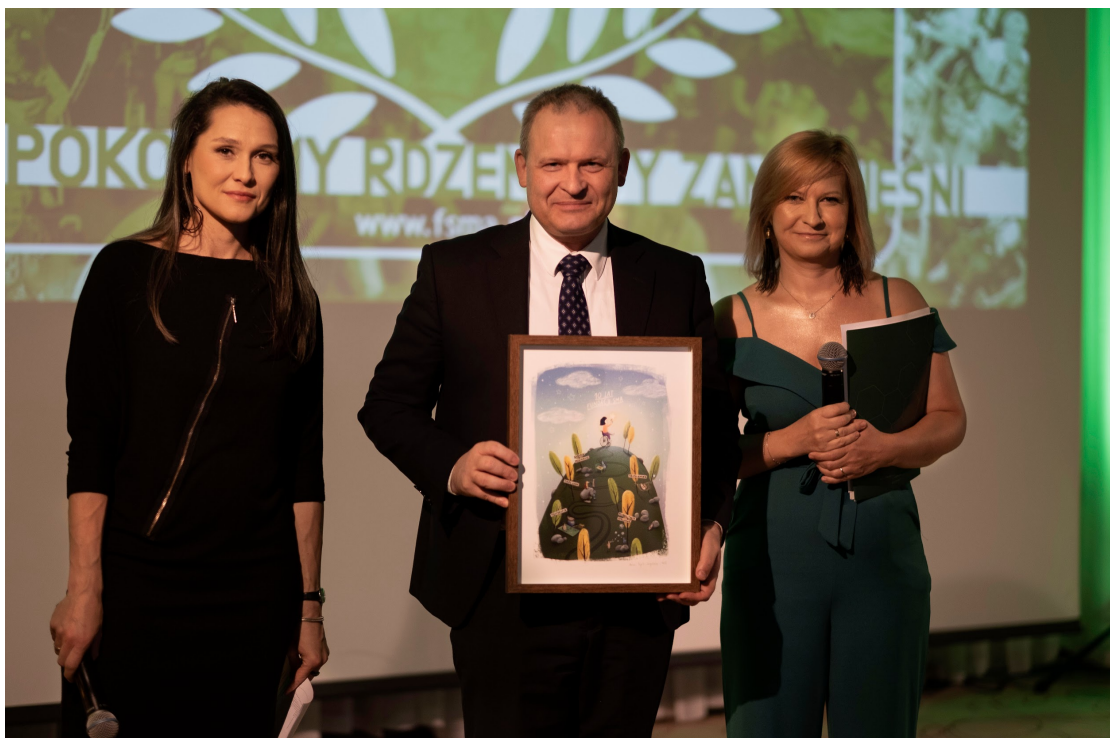
special thanks to Ministry of Health during annual international conference “Weekend ze SMAkiem”

https://youtu.be/Pa1-kFRS3VE?si=HSj3CCSeFg9ld42l